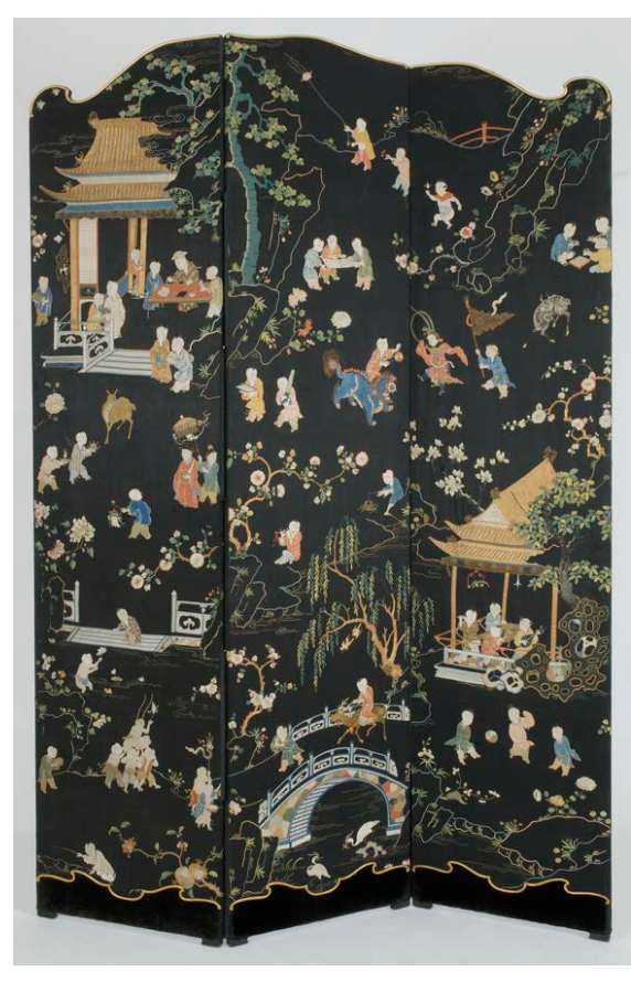
"Chinese paravent" Liechtenstein Museum (18th ct)