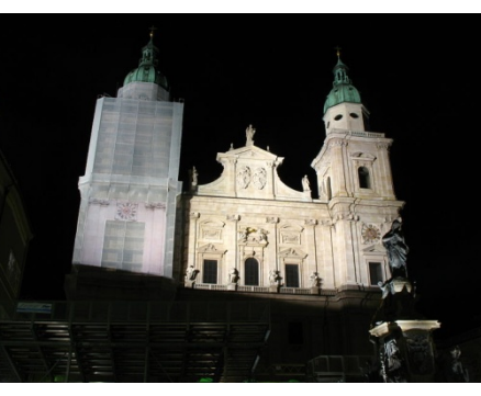
- Dome of Salzburg