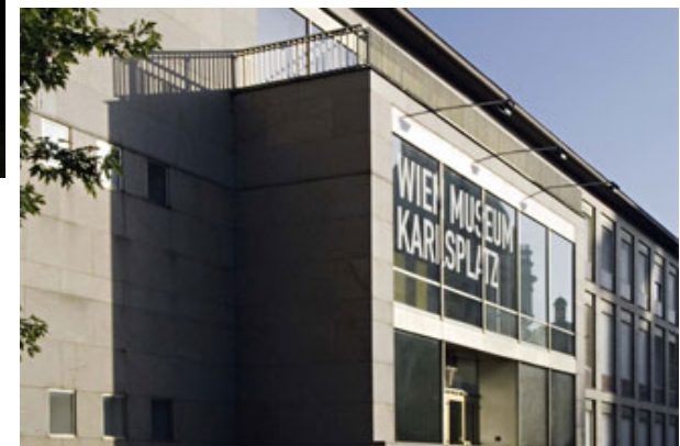
- City Museum, Vienna